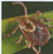
American dog tick