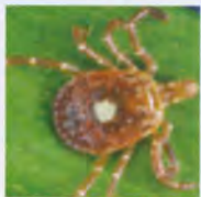
Lone star tick