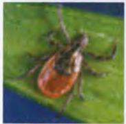
Black-legged “deer” tick